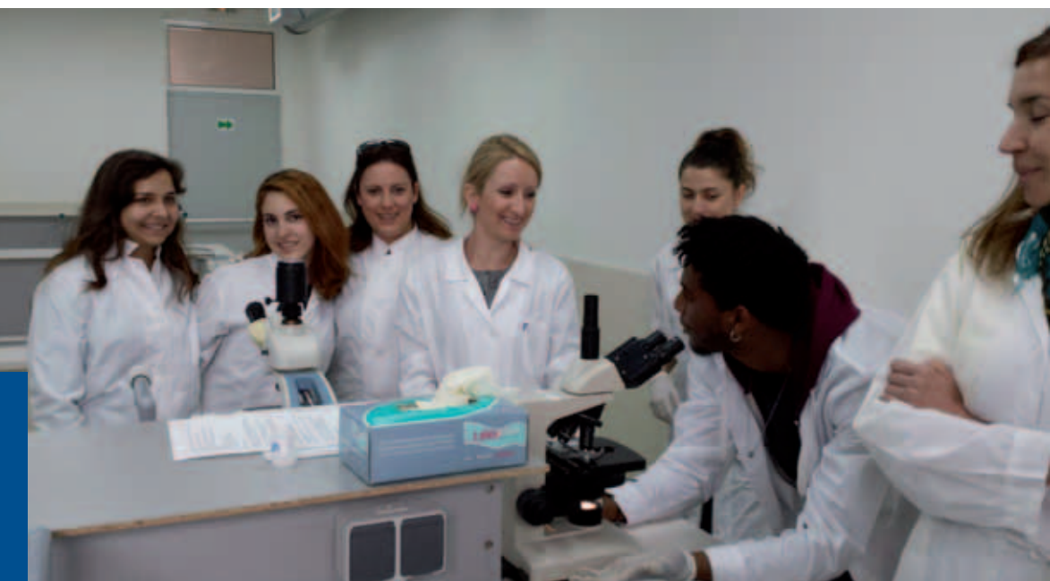
Students of the BA Hons Human Nutrition in the NYC Chemistry Laboratory.

This is a career-oriented program that allows students to gain a broad foundation in all key areas of biological science, as well as to develop a wide range of scientific skills necessary for employment or for further study. Career opportunities for nutrition graduates are diverse, ranging from those in public health to those in production, laboratory and research sectors. These cover public health, food safety and security, food design and production, food analysis, nutrition and health research.