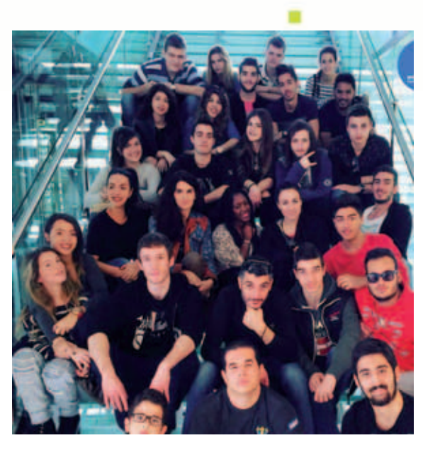
Communication students visiting Digital Revolution Exhibition

Organizations face many challenges communicating in a global economy. From executives to employees and to activists, organizations must interact with a variety of key stakeholders and diverse publics. The mission of the Department of Communications at New York College is to offer high quality education, in cooperation with the State University of New York, Empire State College, USA, aiming at equipping students with the knowledge and skills necessary for making a significant contribution to the new globalized environment. The NYC Communications Department is characterized by the fact that the principles of basic communication converge and coexist with media, science, and technology. The specific topics that are addressed are as diverse as the faculty and student population who explore these areas in their research projects and courses. The Department's breadth of curricula, diversity of student body, scholarly activities of the faculty, as well as its contacts with the business world, have secured for it a reputation for excellence. In particular, NYC has developed business links with major media channels and key figures in the field, thus providing students with experiences that go beyond the classroom.