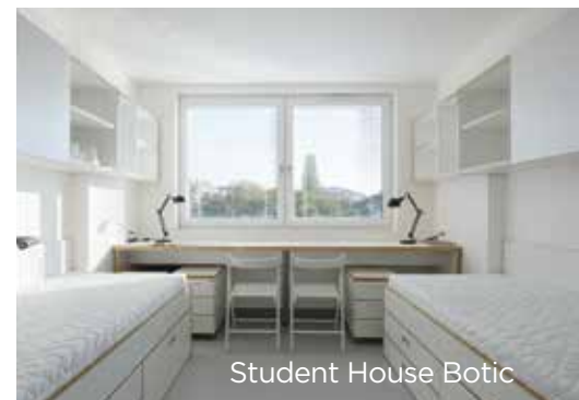
Student House Botic